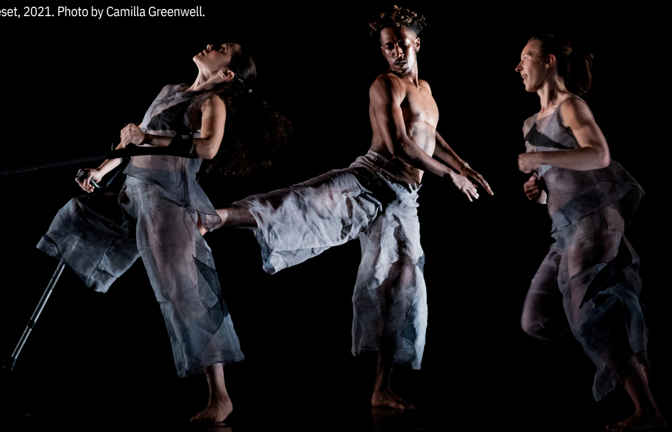
Set & Reset/Reset, 2021.

Candoco is a learning organisation. 'Take the Floor' is how we keep the conversation about disability and dance alive within our own walls, by inviting in voices and ideas from beyond them. We commit to running two discussion sessions with our board a year about disability and dance. Our Lead; Access and Equity is responsible for this 'disability advisory' mechanism. We keep a live form on our website open for people to submit a provocation, something they think our team and board need to hear. Alternatively our Lead; Access and Equity may reach out to someone they know of. Trustees can also submit suggestions.