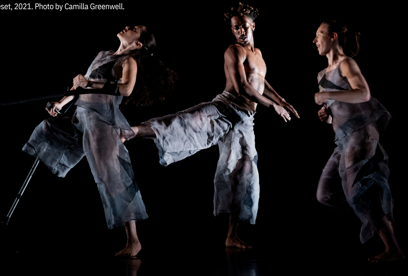
Set & Reset/Reset, 2021.