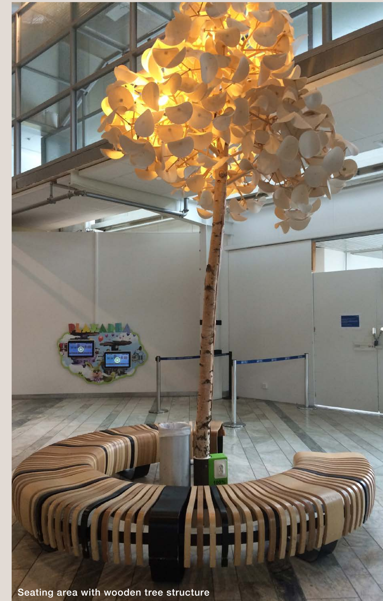
Seating area with wooden tree structure