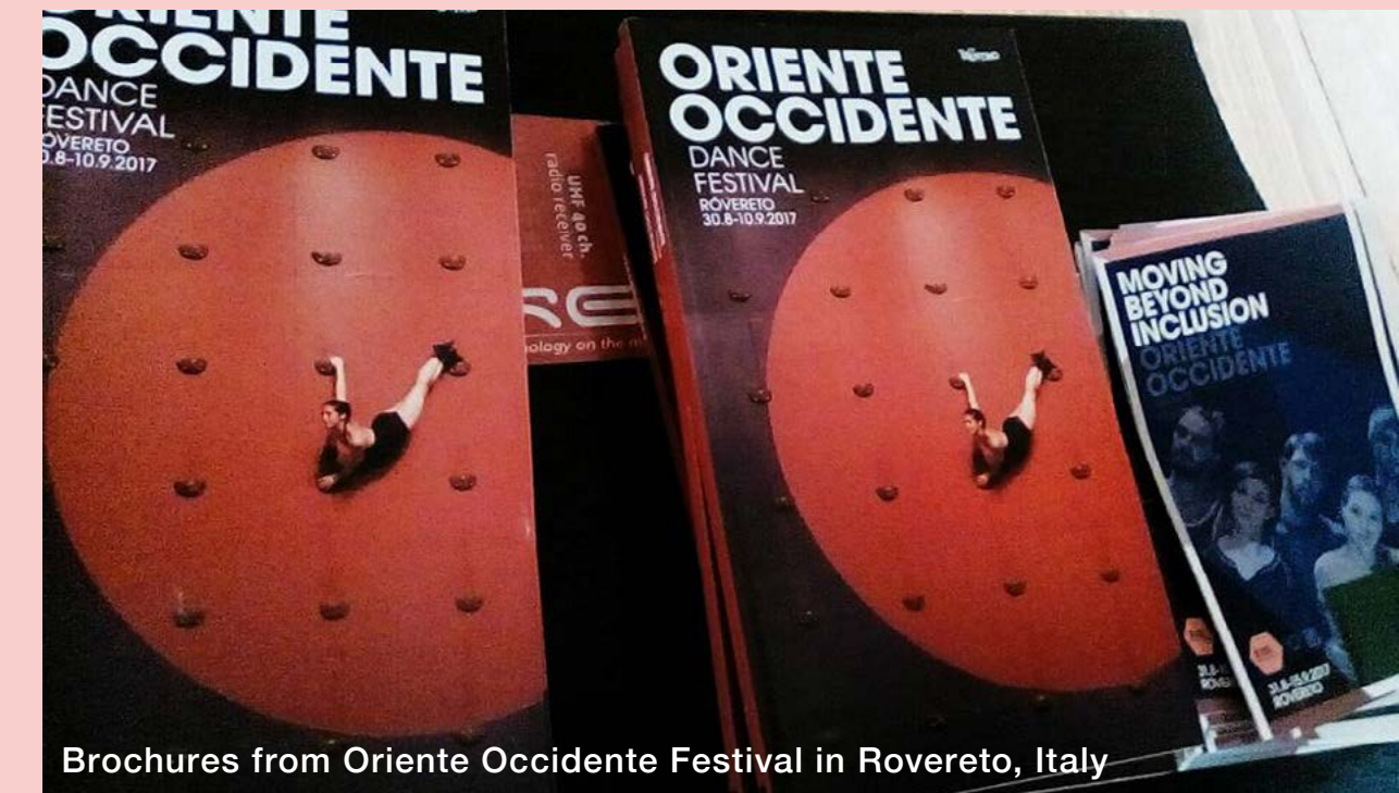
Brochures from Oriente Occidente Festival in Rovereto, Italy

I became a professional dancer because I realized that I can do it. Dance for me was love at first sight. I want to work on performances and travel with my colleagues all over the world. I also want to say that if I were not dancing I would sit at home and watch TV or sit in front of the computer. Dancing has also helped me to escape my loneliness. If there were no dancing,