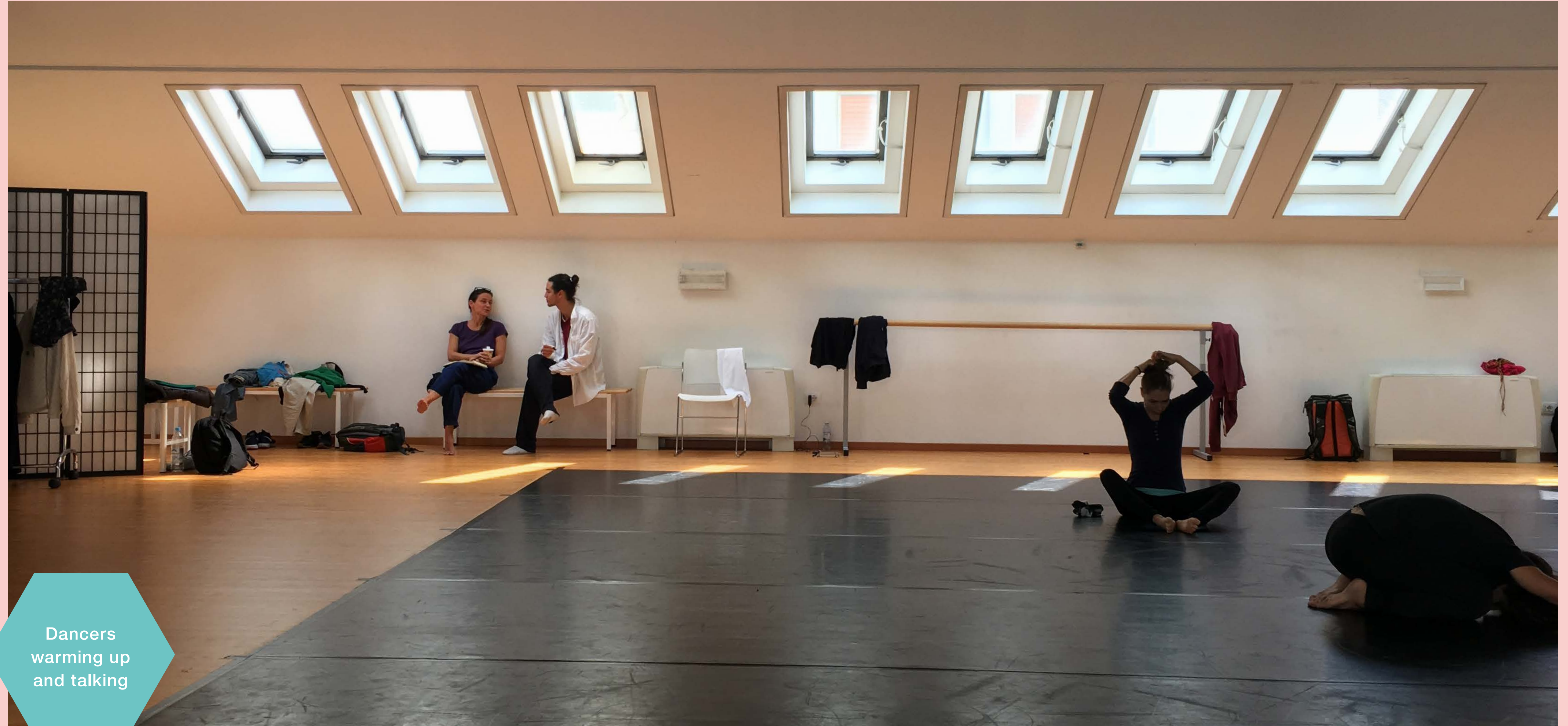
Dancers warming up and talking